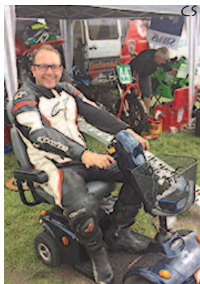
When I pack up racing bikes.....